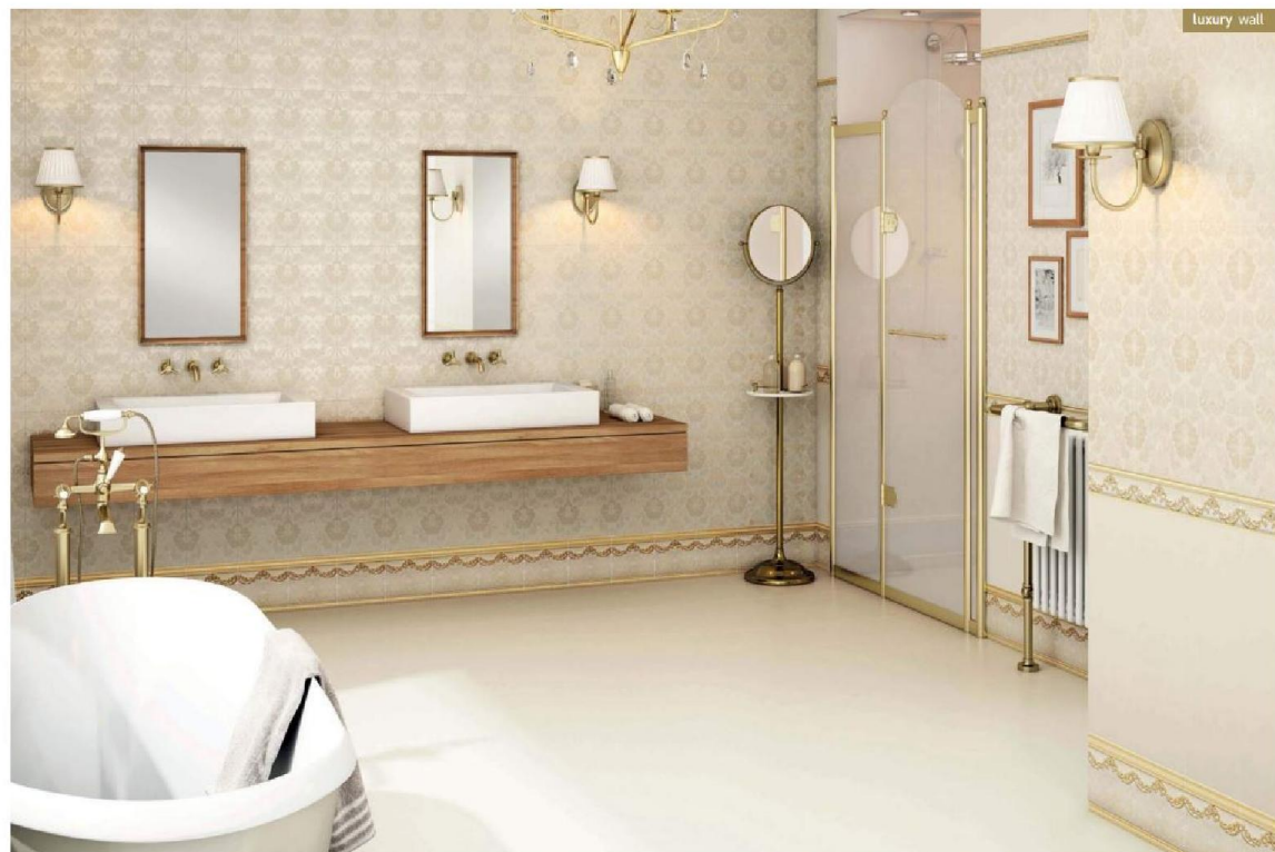
wall: Pashmina ivory - ivory decor - ivory cenafa 20x59,2 cm - Cachemir gold mold - cl - zicalo floor: Pashmina ivory gres 49,1x49,1 cm