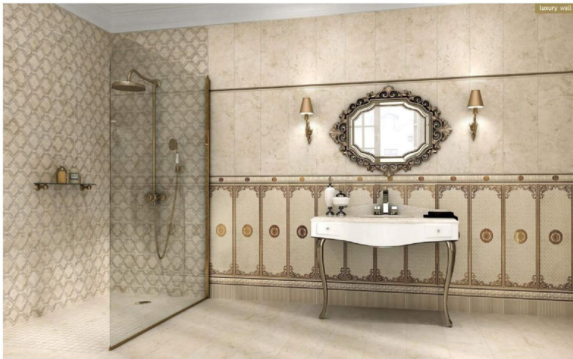
wall: Creta beige 25,1x75,6 cm - triso decor 25,1x18 cm - Creta Likta floor: Creta ivory natural 34,9x180 cm