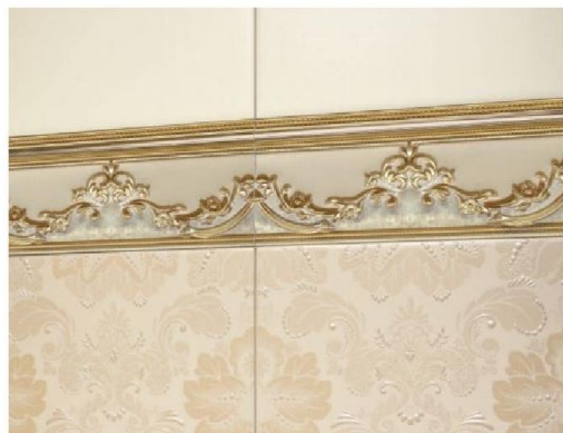
Pashmina ivory - ivory decor 20x59,2 cm - Cachemir gold cenafa